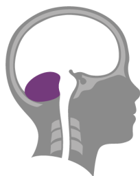
I DON'T have Chiari

If left untreated, Chiari can lead to the development of a fluid-filled cyst in the spine (syringomyelia) and cause permanent nerve damage and paralysis.