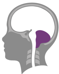
I HAVE Chiari

Chiari Malformations are located at the base of the skull. Part of the brain, the cerebellum, descends out of the skull into the spinal area. This results in compression of parts of the brain and spinal cord, and disrupts the normal flow of cerebrospinal fluid (a clear fluid which bathes the brain and spinal cord).